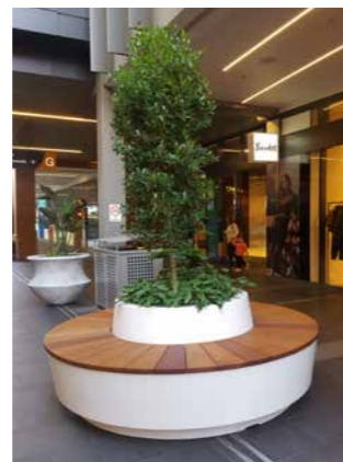
Soul Collection Features timber seating integration