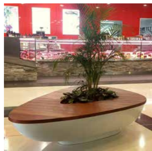
Delta Collection Features a Tonka hardwood deck