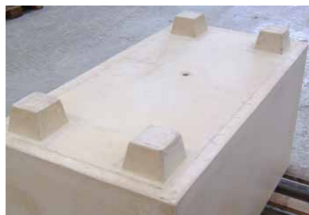
Modular Trough Series Features 75 mm high feet