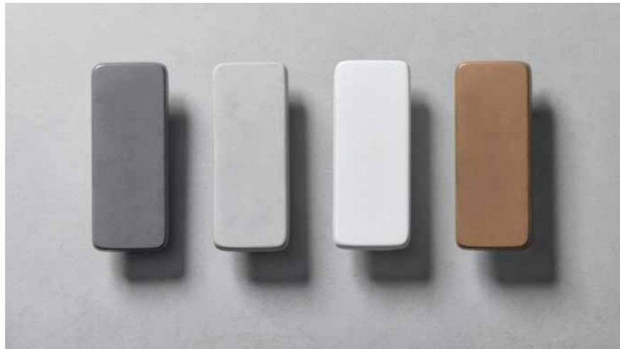
Left to right, charcoal, concrete grey, white, and kalgoorlie