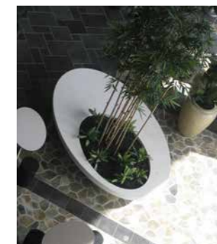
Custom Seat Planter Westfield Carindale