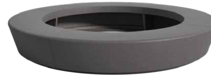
3200 Bondi (Four 1/4 Sections) ○ BON323248 D 3200 x H 485 mm 630kg Approx Weight