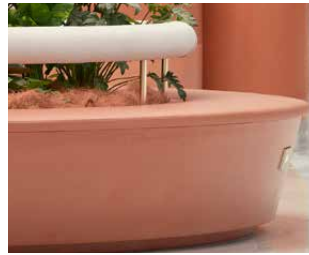
Upholstered seating inserts available as a timber alternative to Alfresco and Bondi. Discuss your requirements with our sales team.