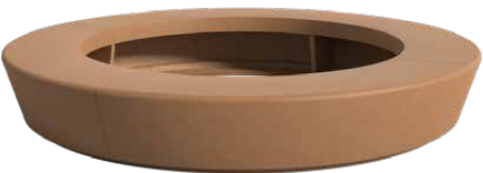
3200 Bondi (Four 1/4 Sections) ○ BON323248 D 3200 x H 485 mm 630kg Approx Weight