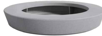
3200 Bondi (Four 1/4 Sections) ○ BON323248 D 3200 x H 485 mm 630kg Approx Weight