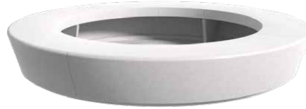
3200 Bondi (Four 1/4 Sections) ○ BON323248 D 3200 x H 485 mm 630kg Approx Weight