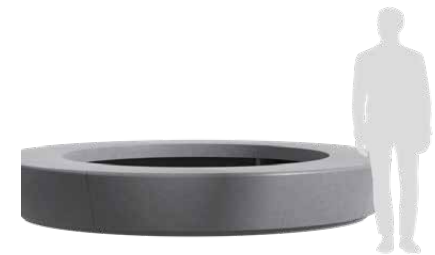
3200 Bondi (Four 1/4 Sections) ○ BON323248 D 3200 x H 485 mm 630kg Approx Weight