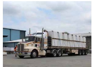
Example of Delivery Vehicle Tautliner Semi-Truck