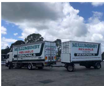
Example of Delivery Vehicle Furniture Removalist