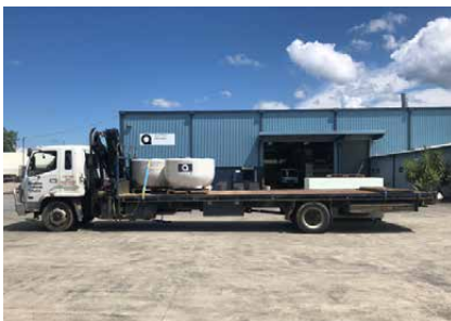
Example of Delivery Vehicle Crane Truck