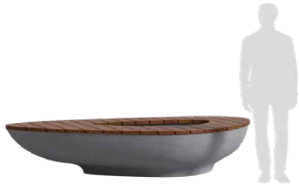
Delta I Trioval Planter & Timber DELTA1TD3P L 2500 x W 1400mm 350kg Approx Weight