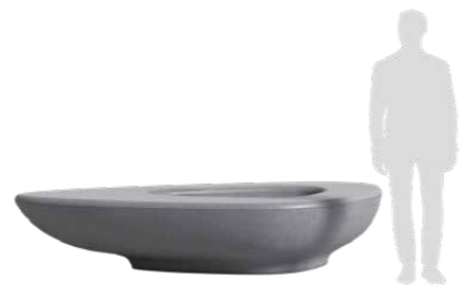
Delta I with Trioval Planter with GRC top DELTA1GD3P L 2500 x W 1400 mm 400kg Approx Weight