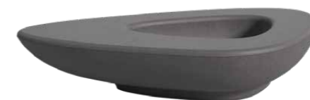
Delta I 900 mm Planter & Timber DELTA1TD90 L 2500 x W 1400 mm 350kg Approx Weight