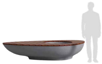
Delta I 900 mm Planter & Timber DELTA1TD90 L 2500 x W 1400 mm 350kg Approx Weight