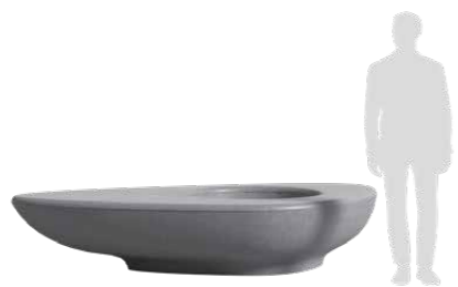
Delta I with 900 mm Planter with GRC top DELTA1GD90 L 2500 x W 1400 mm 400kg Approx Weight