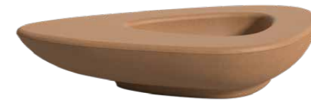
Delta I 900 mm Planter & Timber DELTA1TD90 L 2500 x W 1400 mm 350kg Approx Weight