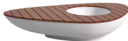
Delta I Trioval Planter & Timber DELTA1TD3P L 2500 x W 1400mm 350kg Approx Weight