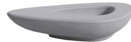
Delta I 900 mm Planter & Timber DELTA1TD90 L 2500 x W 1400 mm 350kg Approx Weight