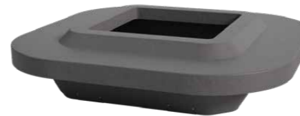
Quad Type A QUAD-A L 2400 x W 2400 x H 450 mm 630kg Approx Weight