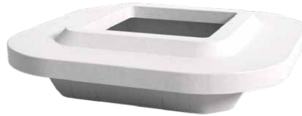
Quad Type A QUAD-A L 2400 x W 2400 x H 450 mm 630kg Approx Weight