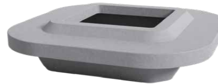
Quad Type A QUAD-A L 2400 x W 2400 x H 450 mm 630kg Approx Weight