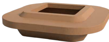
Quad Type A QUAD-A L 2400 x W 2400 x H 450 mm 630kg Approx Weight