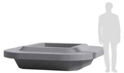
Quad Type A QUAD-A L 2400 x W 2400 x H 450 mm 630kg Approx Weight